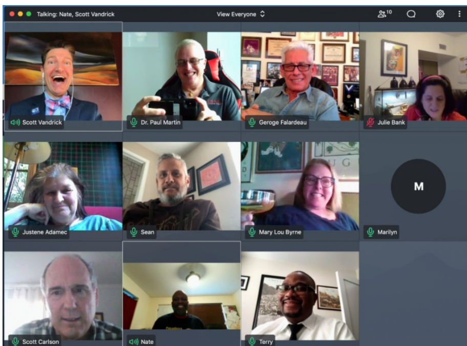
Pasadena Rotary Club's Board of Directors adapting to a new way of getting business done. Hats off to all Board members for their service!

First of all, Happy 100th Birthday, Pasadena Rotary Club! Through our collective goodwill and friendships, we have inspired and uplifted our community, created lifelong, positive relationships, and have weathered any number of storms to emerge at this moment in time. I am proud to be a Pasadena Rotarian, and thrilled to be sharing and celebrate this milestone birthday with all of you! Scroll below to see "Happy Birthday!" photos submitted by members to